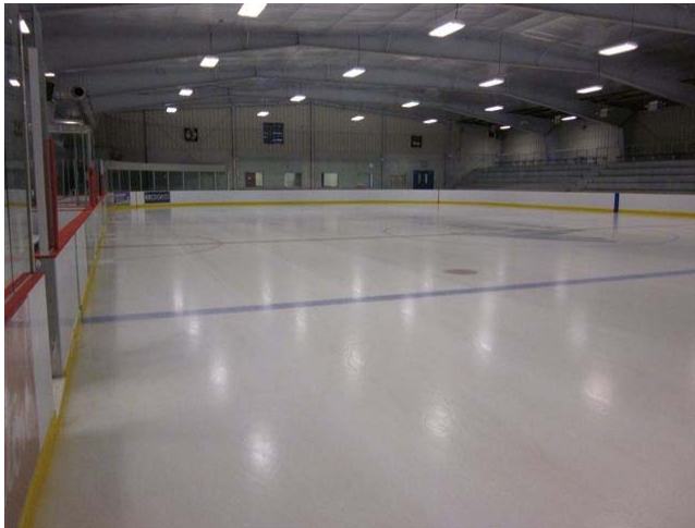
Tonelli boards and glass.