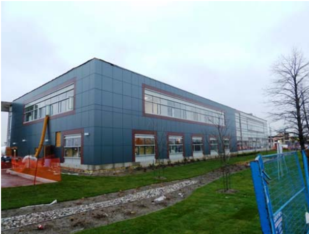
MCA – Library from Thompson Road