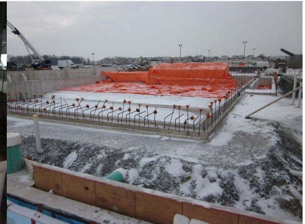
MSC Competition pool.