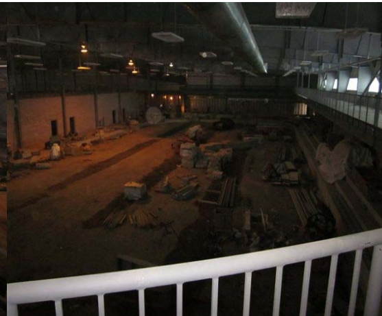
MSC walking track view to ice area