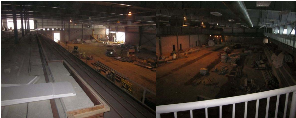
MSC Rink D seating