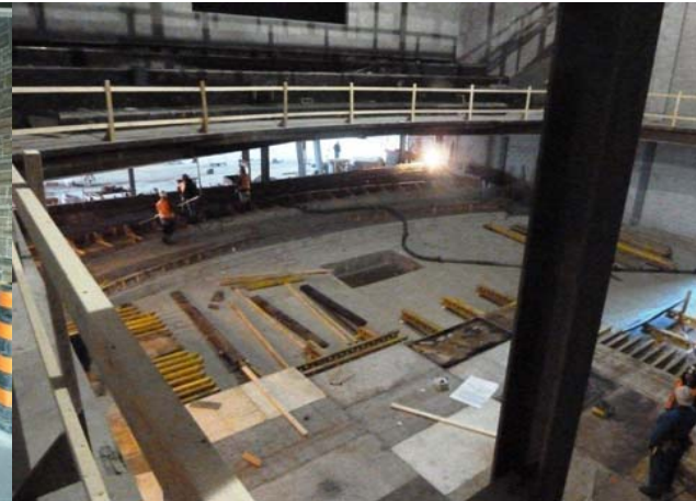
View from balcony of theatre