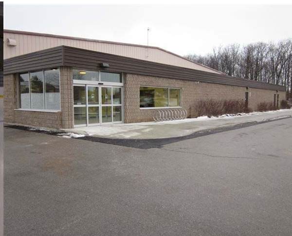
John Tonelli Sports Centre – Front entrance