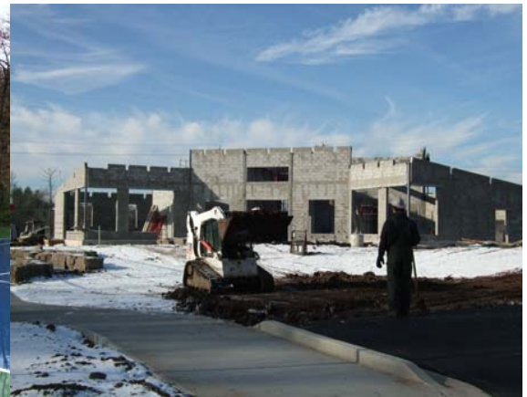
Campbellville / Nassagaweya Tennis Club